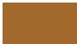
MAPLE WOOD (17)▲◆