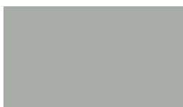
CONCRETE GRAY (08)